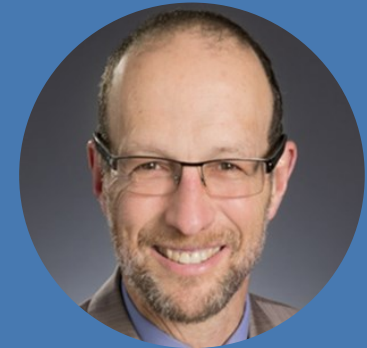
Commissioner Clifford Rechtschaffen