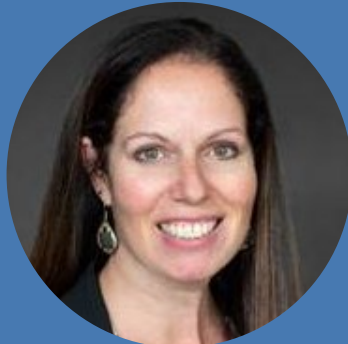
Commissioner Darcie L. Houck