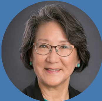
Commissioner Genevieve Shiroma